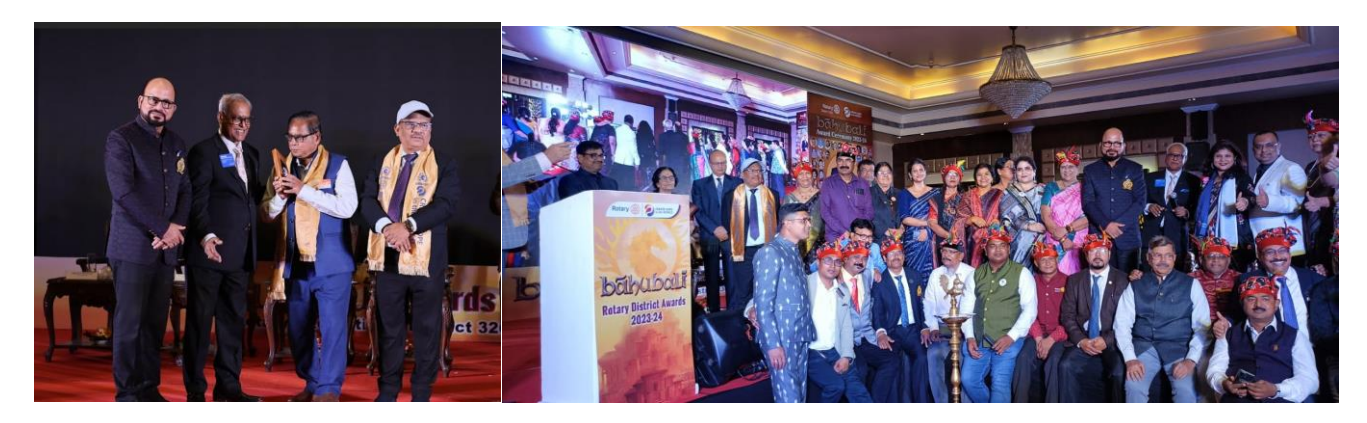
Rotary got talent "Harmonix"