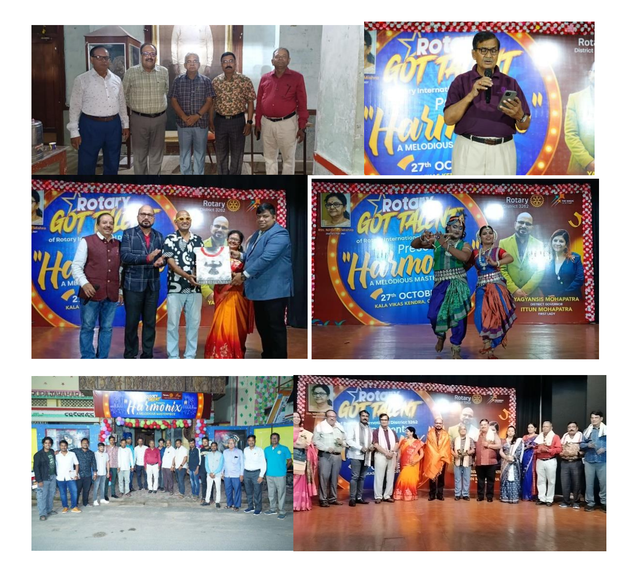
Official District Chairman Visit of Inner Wheel Club Dist. 326